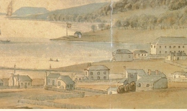
Hobart Town 1819